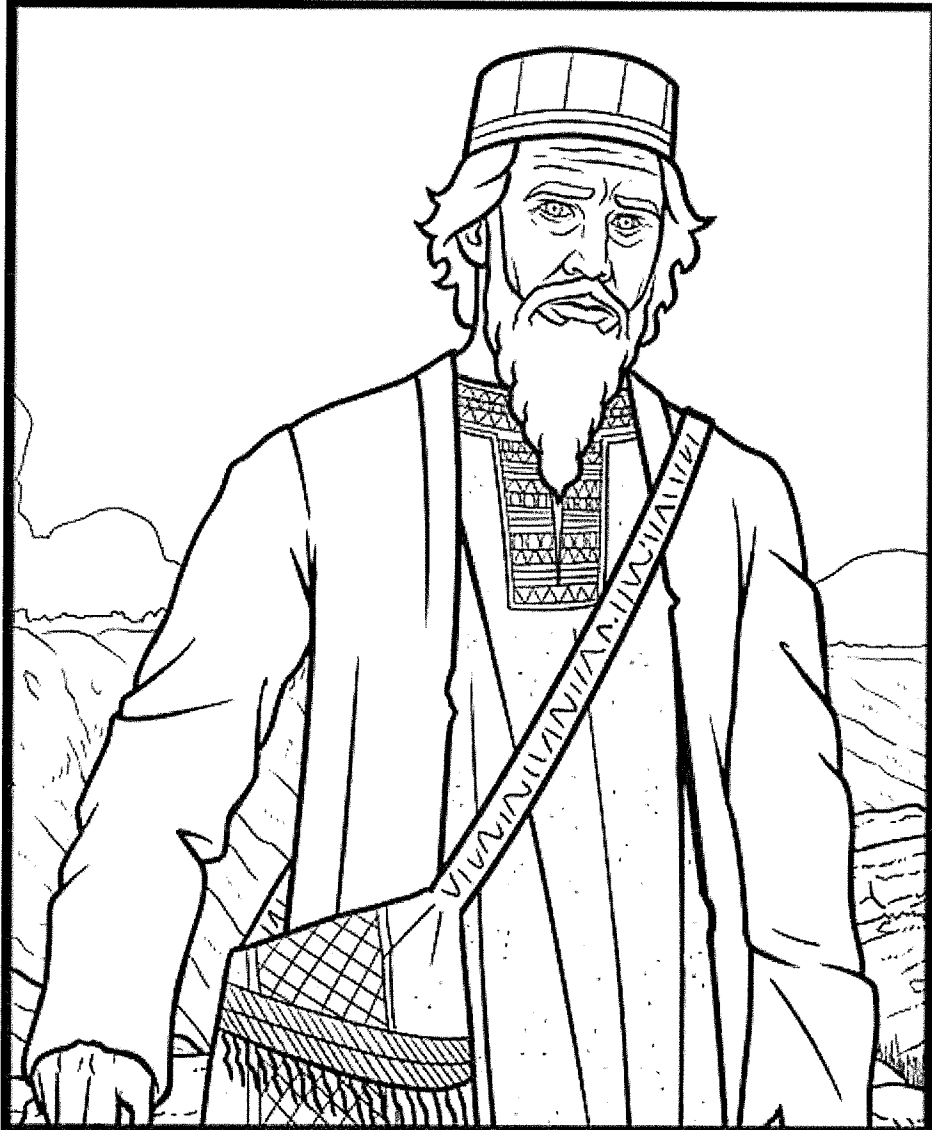
SIMON THE ZEALOT